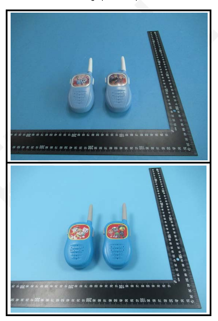
BACL authenticate the photo on original report only

Bay Area Compliance Laboratories Corp. (Shenzhen) 6/F., West Wing, Third Phase of Wanli Industrial Building, Shihua Road, Futian Free Trade Zone, Shenzhen, Guangdong, China