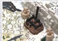
The Wall / Castle Black